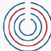
CHART INTEGRATION SERVICES

Expert Advice in Reviewing, Interpreting and Challenging Line Loss Discrepancies 30 plus years Experience in Chart Integration & Gas Measurement