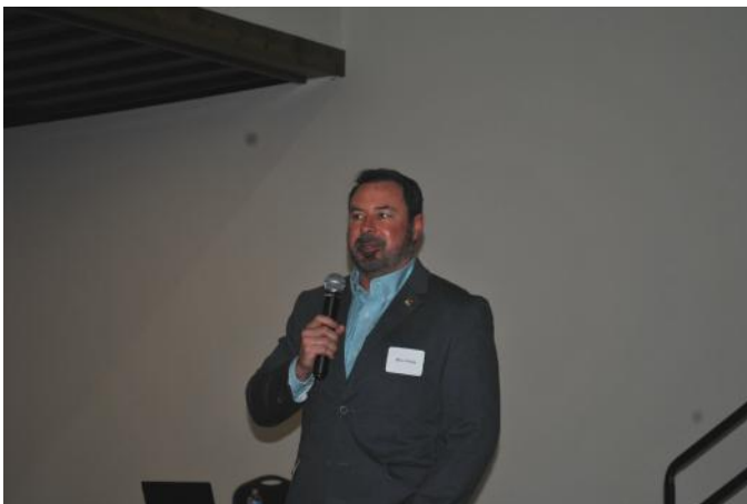
Pictured: Brian Chavez, Ohio State Senator